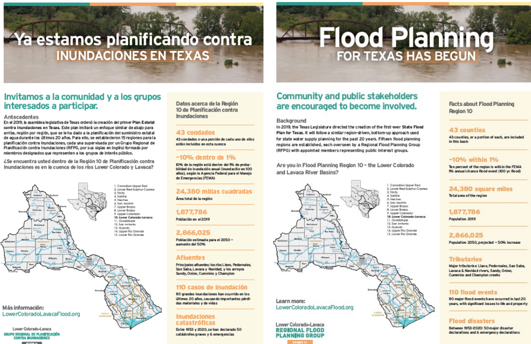
Figure 10.3 Sample Digital Flyers (English/Spanish)