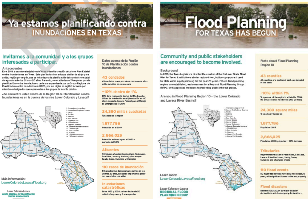
Figure 10.3 Sample Digital Flyers (English/Spanish)

Members of the Lower Colorado-Lavaca RFPG and the public indicated early in the process that a digital flyer that could be easily printed would be a useful tool. In response, the technical consultant developed flyers in both English and Spanish, which are available on the Lower Colorado-Lavaca Region website and shown in Figure 10.3