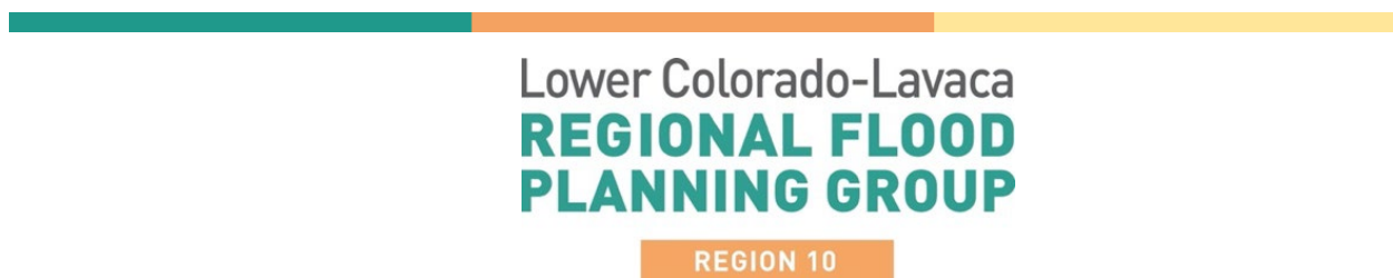
Figure 10.1 Lower Colorado-Lavaca Region Branding

A visual language, style, and color palette was created to provide a consistent look and feel in all public and interest groups' communications and outreach activities. This established a "brand" for the Lower Colorado-Lavaca Flood Planning Region, which helped draw public attention to the planning process. Figure 10.1 below presents the logo developed for the region's website and communications.